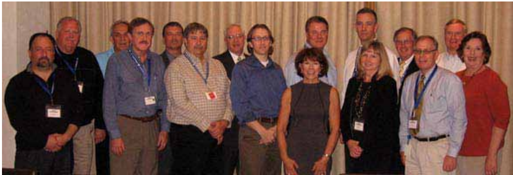
Directors of Indiana's MPOs.

The Indianapolis Metropolitan Planning Organization hosted this year's statewide MPO conference, Connecting Communities, on October 12-14 at various locations throughout the White River State Park. Conference sessions and breakfast and lunch each day were held at the Eiteljorg Museum. Attendees were given free passes to tour the museum on breaks between sessions. A welcome reception at the NCAA Hall of Champions allowed conference attendees to test their soccer skills on a simulator, shoot hoops in a 1930s retro basketball gymnasium, and tour the facility. The Annual MPO Conference Awards Dinner took place in the lobby of the Indiana State Museum, and guests were also able to tour the 2 nd floor gallery before dinner. Entertainment for the evening was provided by a string quartet from the Ben Davis High School Orchestra.